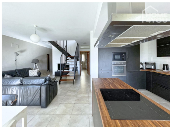
Wohnbereich und Küche