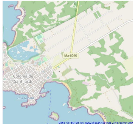
Colonia Sant Jordi