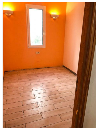
Gästezimmer mit neuem Boden