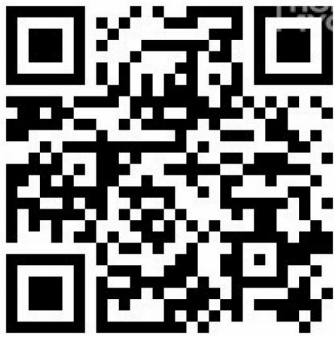
QR Code Auslandsimmobilien