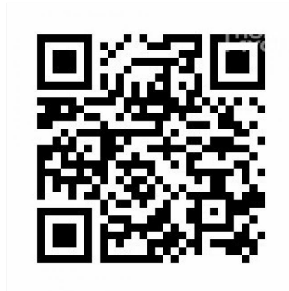
QR Code Auslandsimmobilien