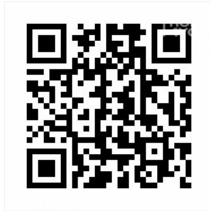
QR Code Kaufabwicklung