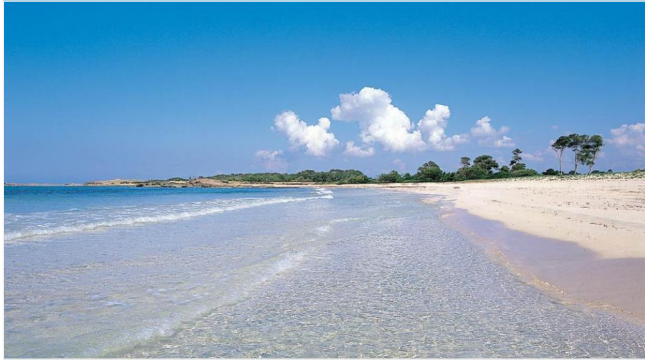
Traumstrand Es Trenc